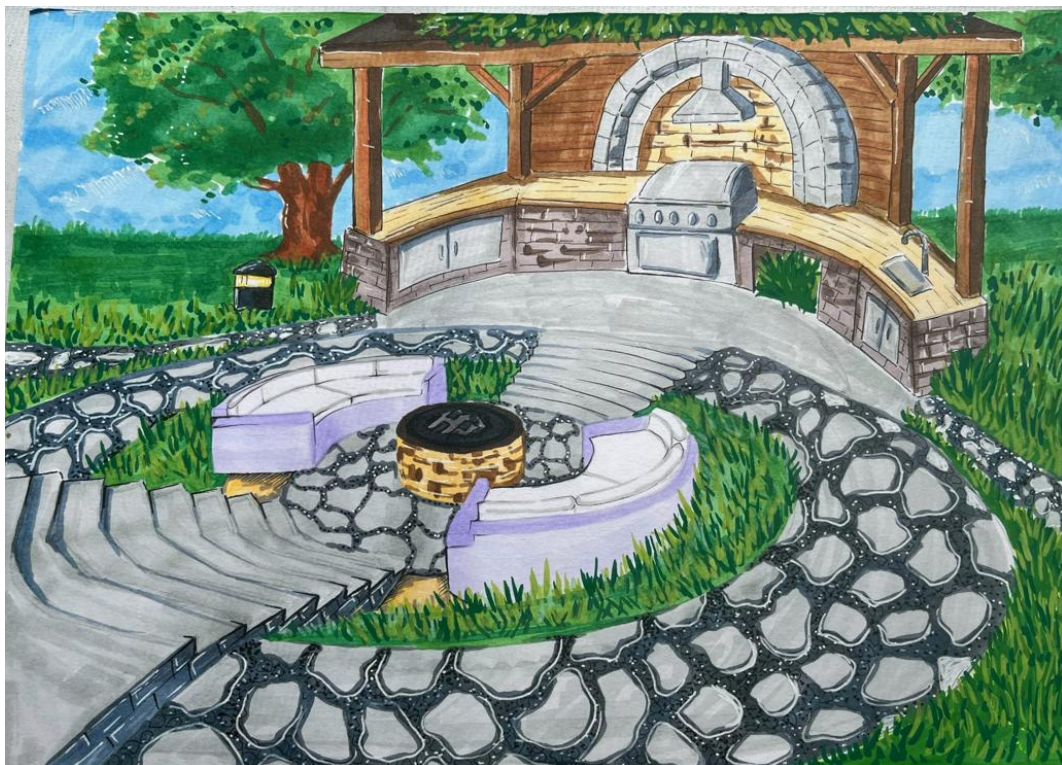
Figure 3. The fire pit and outdoor kitchen area