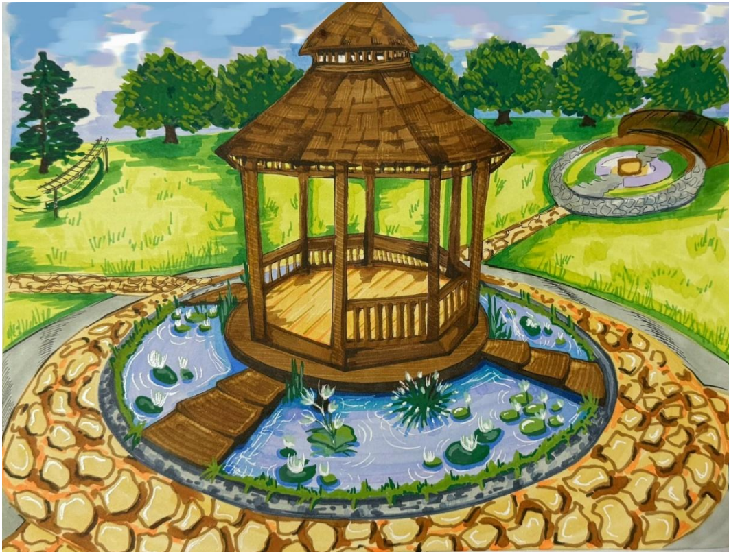
Figure 2. The pavilion