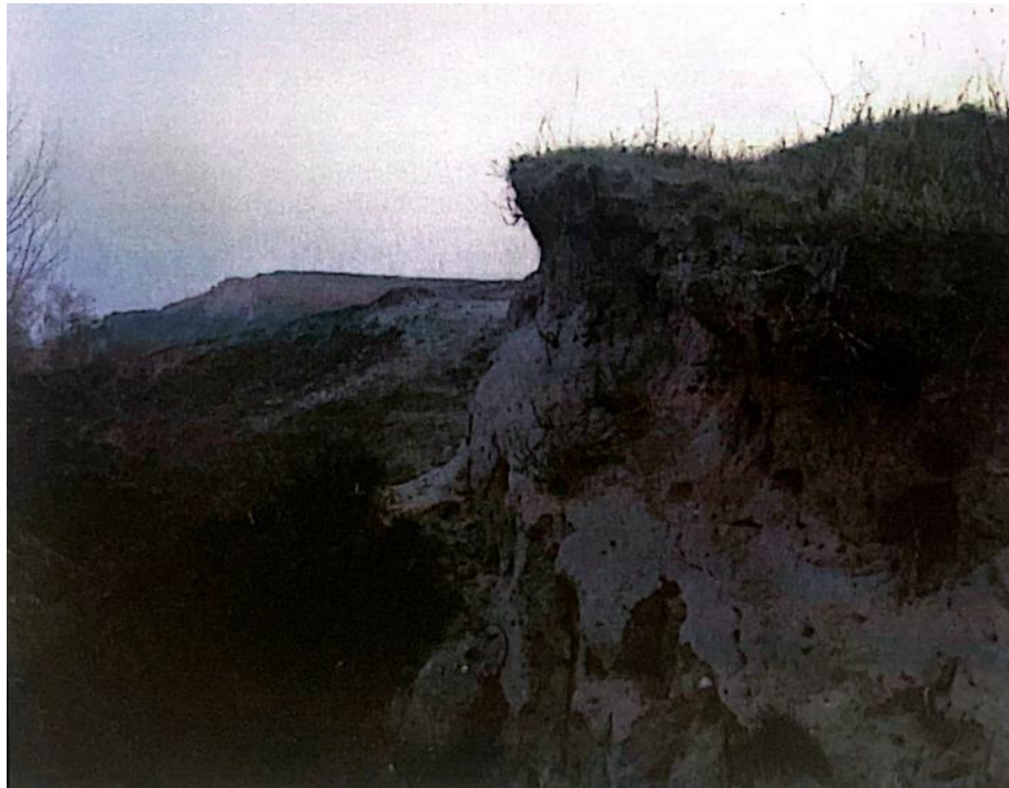
Figure 3. The highest area of Ostrov (133 m), completely degraded by wind erosion and landslides

Climatically, Moldova Veche Ostrov falls within province 1Bp3, characterized by a moderately continental climate typical of western piedmonts, with Banat influences. The topoclimate is shaped by the Danube corridor and gorge, where fragmented relief generates a diversity of local atmospheric processes influenced by air circulation and orographic disturbances.