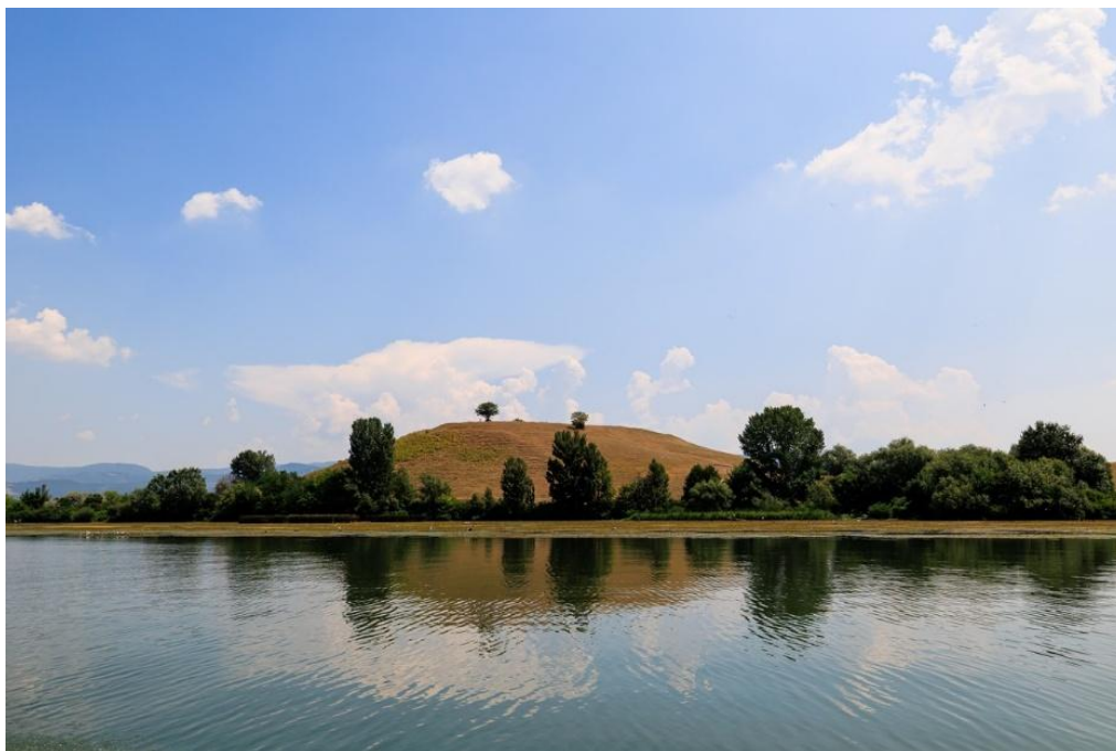
Figure 2. Ostrov Island

velocity of the Danube (1.0–1.3 m/s) has favored the accumulation of alluvial deposits behind the Coronini barrier.